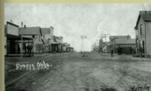
Owasso Main Street 1909

Visit the Owasso Museum to learn more about Owasso's history.