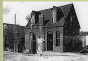
CH Roger Shell Station (about 1930) Inspiration for proposed replica CNG filling station

Visit the Owasso Museum to learn more about Owasso's history.